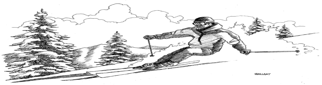
Sketch by Marty Gallant